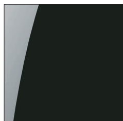
Black High Gloss